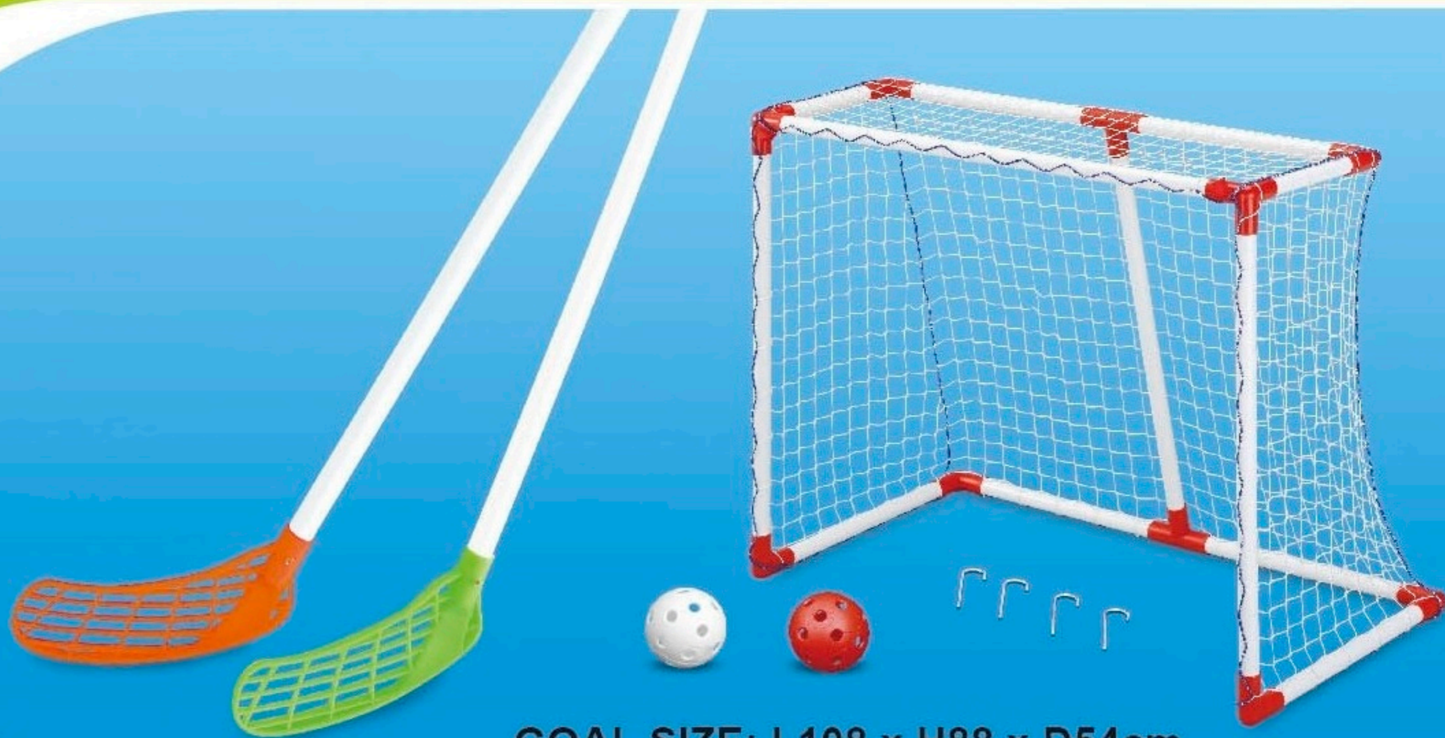
GOAL SIZE: L108 x H88 x D54cm